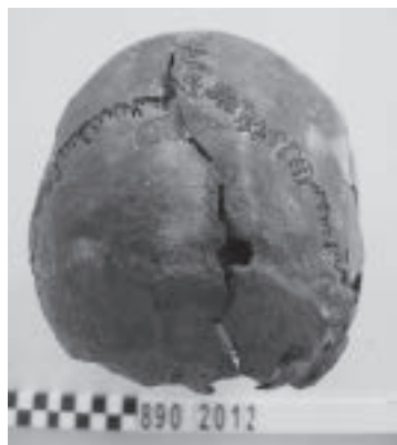
Photograph 4

PPSh and PPS. (Jureket al. 2014). Most cases represent a single gunshot from a handgun with a calibre of 7.62 mm, aimed at the back of the head (photograph 4) (Szleszkowski et al. 2015). The nature of the ascertained wounds shows a unique concurrence with the results of work carried out at the sites of execution of Polish officers in Katyn, Mednoye, and Kharkov (Baran et al. 1993, Baran et al. 1993a, Baran 1998). In the vicinity of these places, in 1940, the NKVD killed more than 10,000 Polish prisoners of war held in camps in Kozelsk, Ostashkov and Starobelsk. In the case of victims of the post-war repression, the ritual of executing by a firing squad was abandoned in favour of a method inconsistent with the gravity of a court sentence. A shot in the back of the head at close range was a very effective method; it did not involve a large number of people in executions, and was a proven method of eliminating human beings.