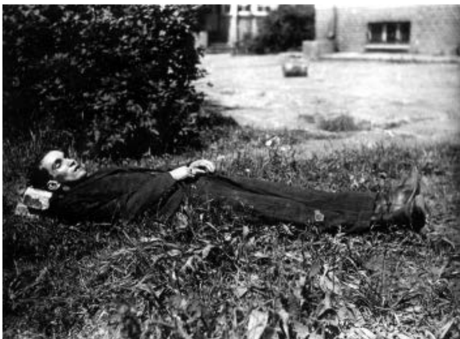
Photograph 3: Corpse of Lt. Zdzisław Badocha killed in a raid by the Secret Political Police, Civic Militia, and Internal Security Corps after transfer to the Secret Political Police office in Sztum

During Communist Party rule, places inaccessible for third parties were often chosen for burial of the corpses of the victims – as for example military training areas, prison and custody yards or Secret Political Police offices (photograph 3). The corpses of those killed in combat with