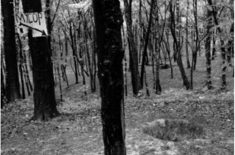
An estimated 90- to 100-thousand people were shot, burned and buried in Lisinichi forest, close to Lviv, Ukraine. The improvised sign pointing to a hole in the ground reads "garbage".