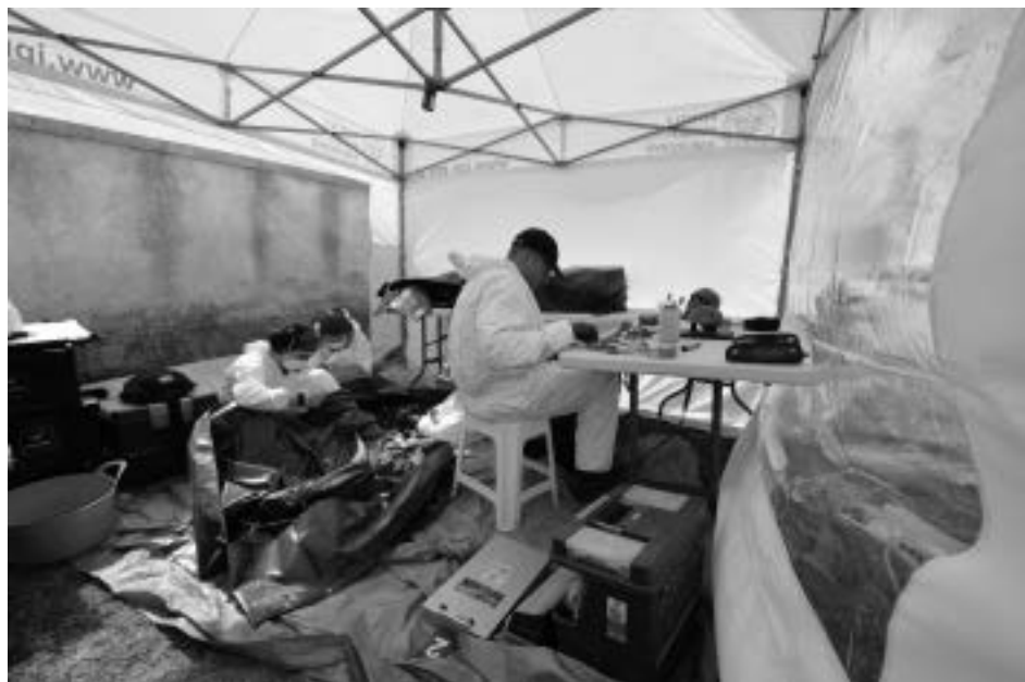
Photograph 8: Mobile laboratory, Rzeszów, Poland