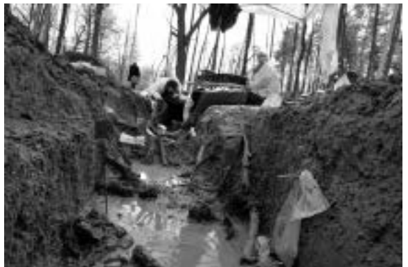
Photograph 7 B: Exhumation from a mass grave, Stary Grodków, Poland