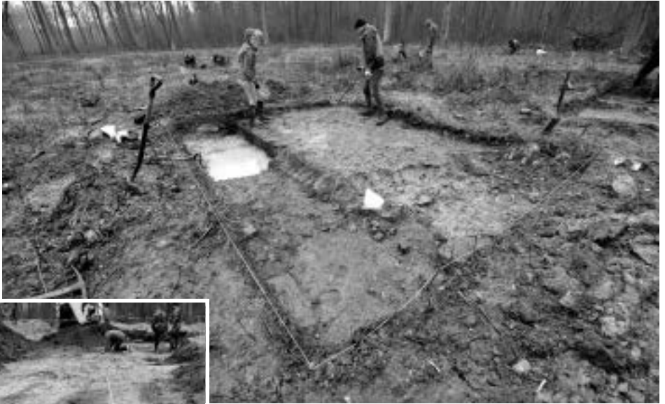
Photograph 6: Setting a survey excavation, Stary Grodków, Poland

Removal with an excavator of a layer of humus on an area of about five acres in the vicinity revealed outlines of mass graves, placed in craters resulting from mortar fire as well as a ditch. (photographs 7 A and 7 B)