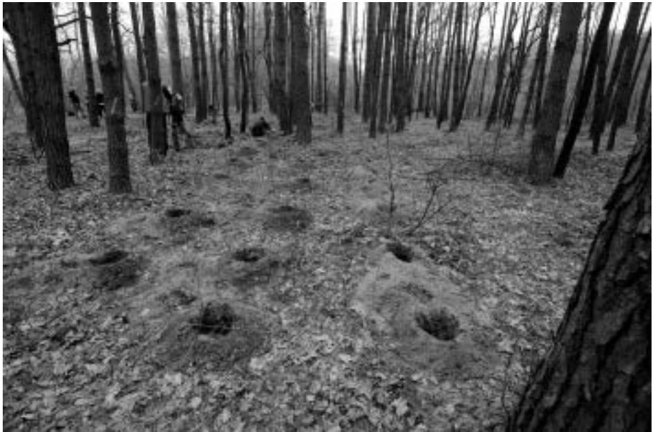
Photograph 4: Archaeological drillings made during the search for the mass graves of the soldiers of the National Armed Forces, Barut, Poland

It was decided that such complementary methods (among other approaches) would be used when, in March 2016, exploration began of the