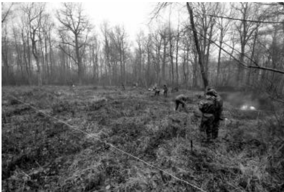
Photograph 5: Research carried out with the use of a metal detector within the designated sectors, Stary Grodków, Poland

mass graves of soldiers from the National Armed Forces serving in Capt. Henryk Flame's "Bartek" unit, who had been vanquished in 1946. On the basis of the analysis of archive materials and witness evidence it was possible to establish that a group of about thirty people (approximately one third of the unit) was transported to the area of a former Luftwaffe airport in Stary Grodków and accommodated in a mined barracks that was blown up. The first traces of mass murder were already identified during work with using a metal detector involving military engineers (photograph 5) – a gorget with the image of the Mother of God against the background of a crowned eagle presented clear evidence of soldiers from Capt. Flame's unit 2 .