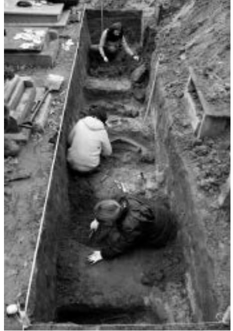
Photograph 1: Archaeological and exhumation work, Wrocław, Osobowice Cemetery, Poland

Aerial photographs can prove helpful in locating the area of the developed prison burial plots, as was the case with two necropolises in Warsaw: 1) the Powązki Military Cemetery and 2) the cemetery at Wałbrzyska Street in Służew. The first photograph (taken during an air raid over Warsaw in 1955) clearly shows diagonal dark zones which mark rows of graves. The