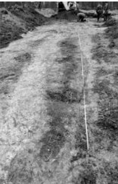
Photograph 7 A: Mass grave, Stary Grodków, Poland