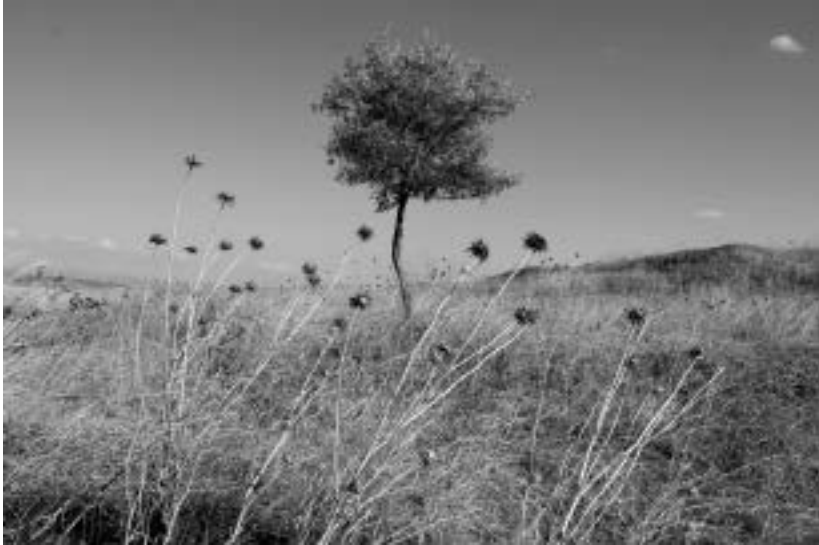
Field in Soghanlugh, Georgia. The field belongs to a farm run during the 1930s and 40s by the Soviet People's Commissariat for Internal Affairs (NKVD), closely associated with the Soviet secret police, near the Soghanlugh settlement which is located a few kilometers outside the Georgian capital Tbilisi. The field has been identified by Georgian NGO SovLab as one of the areas possibly containing mass graves from the Great Purge 1937/1938.