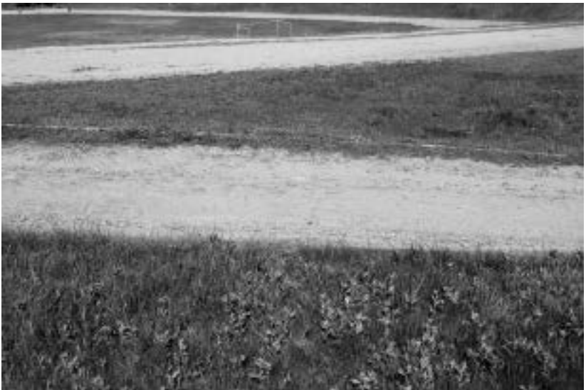
About 10,000 Jews were murdered at this huge death pit in the centre of Dnipropetrovsk, Ukraine. An entire soccer field fits into it.