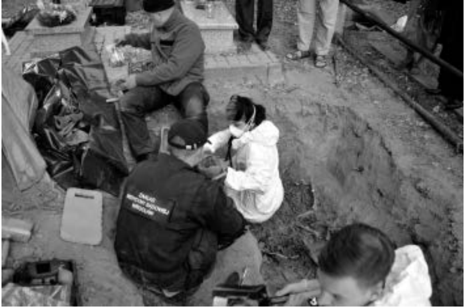
Photograph 9: Exhumation of human remains from a mass grave in Rzeszów, Poland. Each skeleton is exhumed separately

in Georgia research project. In Georgia, the search for victims of the Red Terror (1937-1939) as well as the Georgian Uprising of 1924 is still at the archival research stage. During a visit lasting several days, experiences collected during the projects conducted in Poland were shared and the directions for conducting archival research and historical queries discussed and set. Archive material and evidence given by eyewitnesses focussing on three areas was examined. Preliminary exploration work, examinations and surface surveys were initiated on two of these areas – one on the grounds of a former artillery barracks of the 1st shooting range for cadets in Tbilisi (Saburtalo, Vake), the other on the grounds of the farm of the People's Commissariat for Internal Affairs in the Soghanlugh valley – were conducted in coordination with the chief-investigator of the Georgian project, Irakli Khvadagiani. In one of the selected places (Vake), research by ground-penetrating radar (GPR) was conducted and drillings were made in the place where an anomaly in the soil structure had been identified. No human bones (nor traces of human activity, except for its upper layer) were found in the ground explored – but it must be said that was some