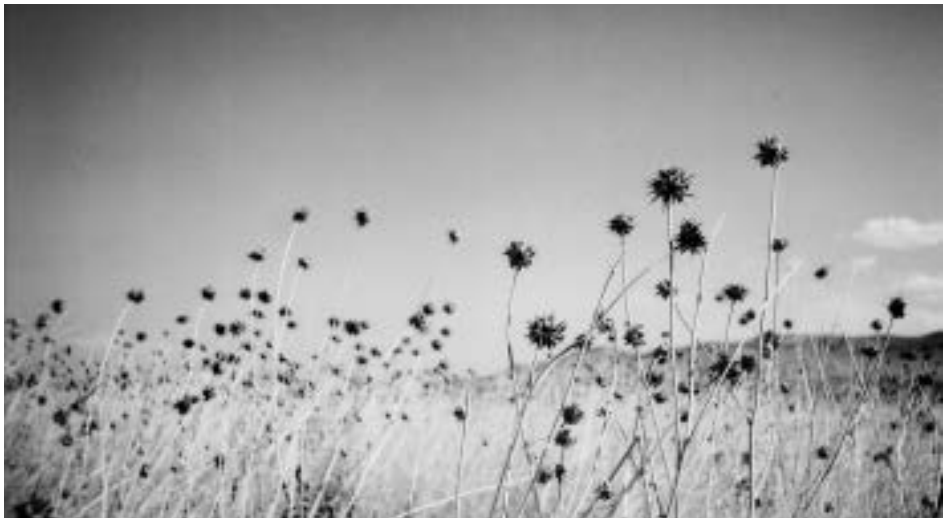
Possible mass grave site Soghanlugi, near Tbilisi, Georgia

Georgia is a small country. Tbilisi, the capital, is a small city, and in principle, probably for centuries, the same families and groups have been determining life here. Elite continuity would be the adequate term. The open-