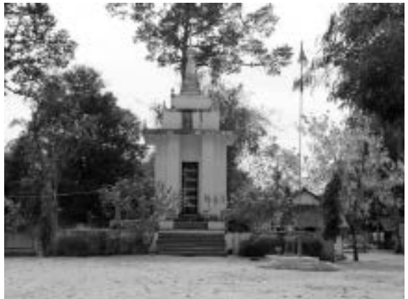
Kraing Ta Chan Mass Killing Site

From 1975 to 1979, the Khmer Rouge transformation programme caused the death of nearly two million Cambodians due to disease, lack of medicines and medical services, overwork, execution, starvation, and torture (Khamboly 2007). After the collapse of the Khmer Rouge, Cambodia continued to have a civil war in the northern and western parts of Cambodia along the Cambodian-Thai border.