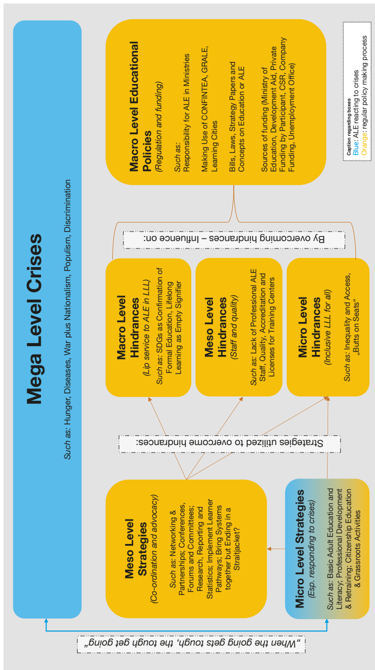
Figure 1: When the going gets tough... How Micro Level Strategies around ALE Contribute to Surviving Macro Level Crises. See also Chapter "Conclusions"